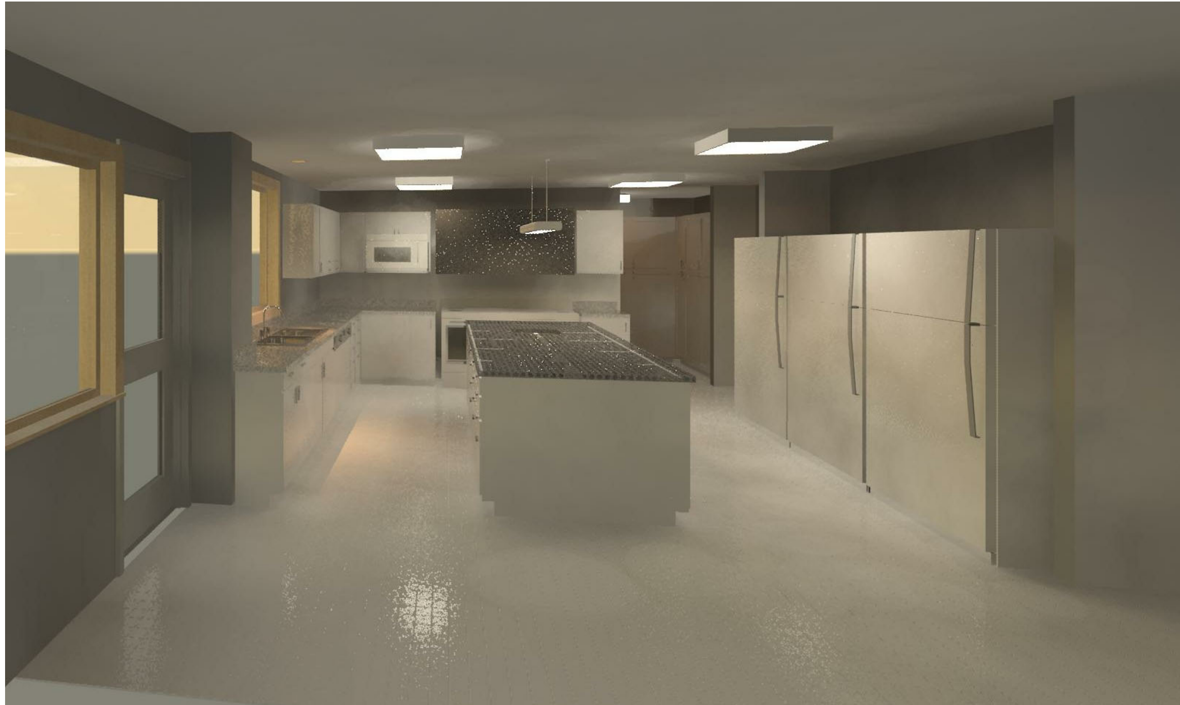
RENDERING - PROPOSED LAYOUT